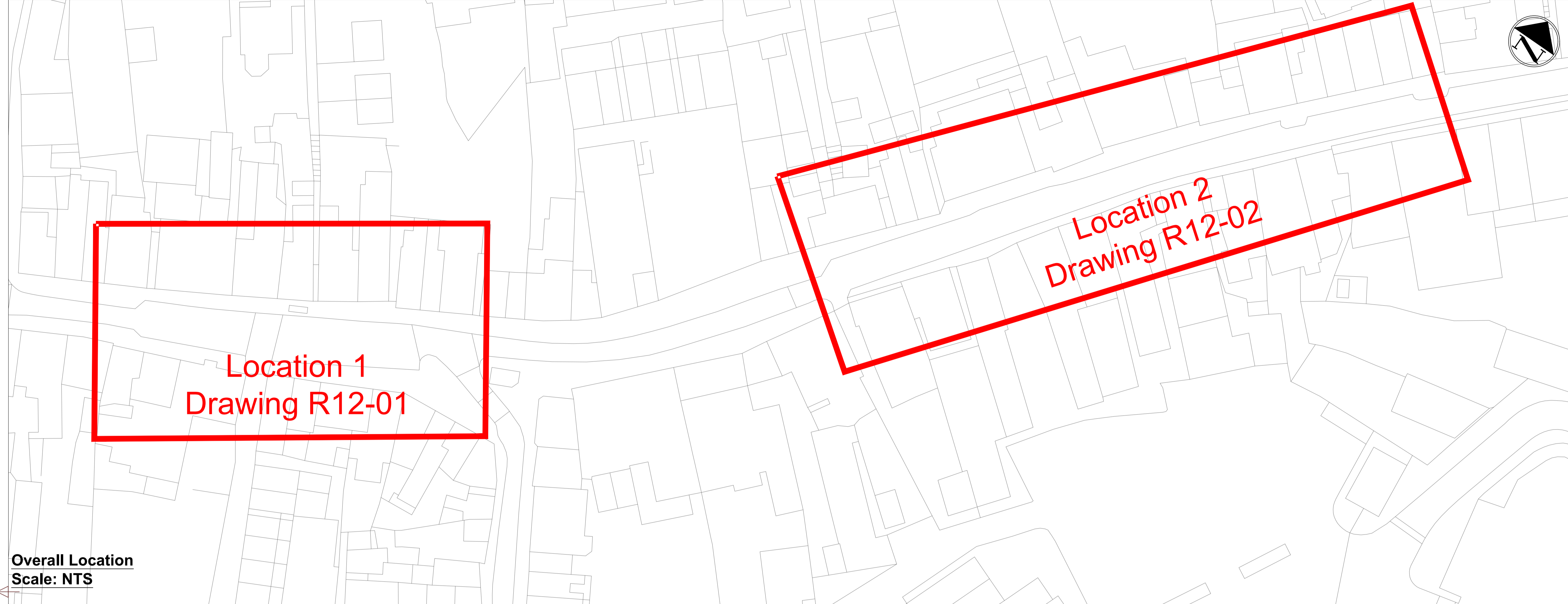
Overall Location Scale: NTS