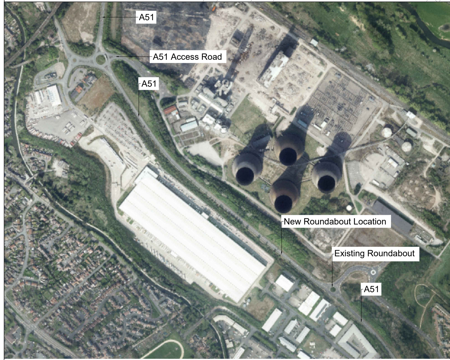
Site Location Plan - NTS.